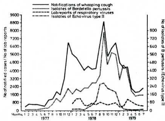
Fig. 1 Whooping cough: England and Wales 1977-9.

B. pertussis and respiratory viruses were obtained from the weekly reports (CDR) of the Public Health Laboratory Service (PHLS) at Colindale and the Communicable Diseases (Scotland) Unit (CDS) at Ruchill Hospital.